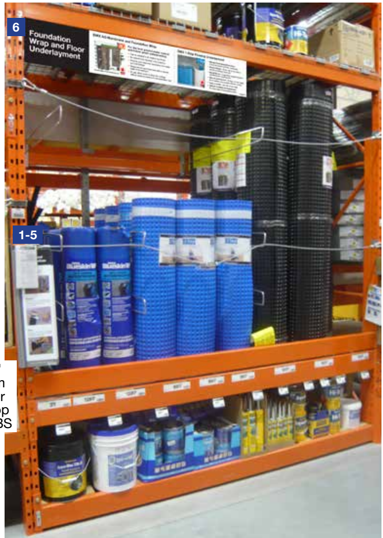
VBS Page 3 (Back)